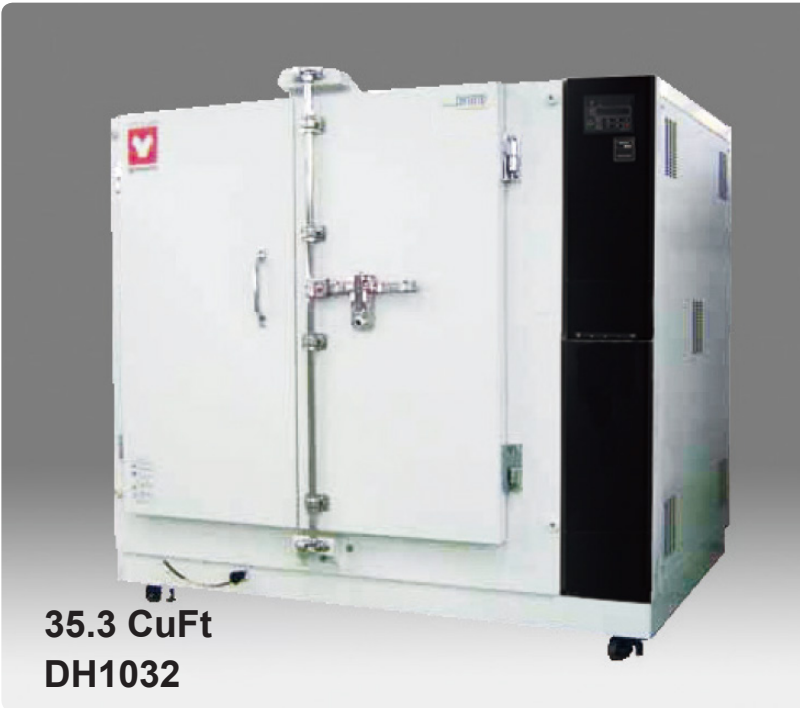
35.3 CuFt DH1032