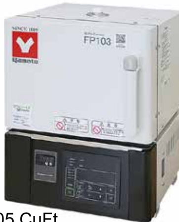
.05 CuFt Model FP103