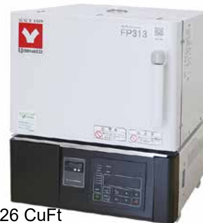
.26 CuFt Model FP313