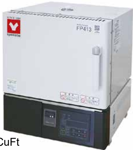
.4 CuFt Model FP413