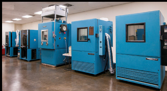
Temperature & Humidity Testing