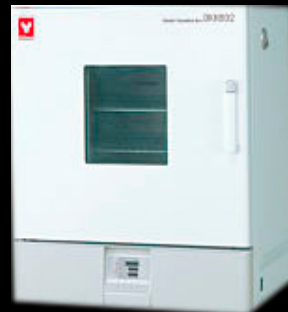
NEW Lab Ovens for Quick Ship