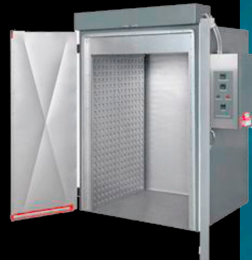
Complete Line of Walk In Ovens - HighTemp Ovens, and More