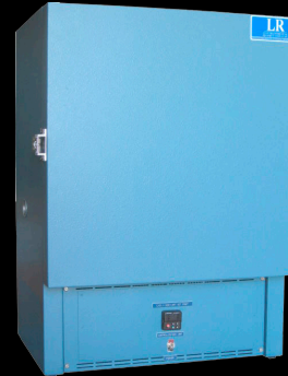
Industrial / Lab Ovens